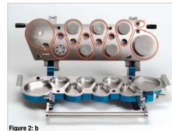
Figure 2: b

a specific nozzle arrangement and a collection surface. With each sequential stage, total nozzle area decreases; so, as airflow remains constant, particle velocity progressively increases. At each stage, therefore, smaller particles acquire sufficient inertia to break free from the air stream and impact on the collection surface (Figure 1). One benefit of cascade impaction is that it directly measures aerodynamic particle size, an intuitively sensible parameter for inhalation applications. Furthermore, there are commercially available cascade impactors that fractionate sensitively in the size range of greatest interest for pulmonary deposition. The ACI (Andersen Cascade Impactor) and the more recent NGI (Next Generation Pharmaceutical Impactor) both have five stages with cut-off diameters in the 0.5–5.0 micron range. Particles <5 micron make up the FPD (fine particle dose), and generally speaking are assumed to deposit in the lung. Usually, this is the design intent of the inhalation product. Unfortunately, these advantages are offset by a number of limitations, the main drawback being measurement time and the amount of labour involved in sample work up. 3 Operated manually, a conventional multistage impactor will normally yield only 5–8 complete measurements per day. Furthermore, operator-to-operator variability can introduce significant variation in the results, compromising data integrity.