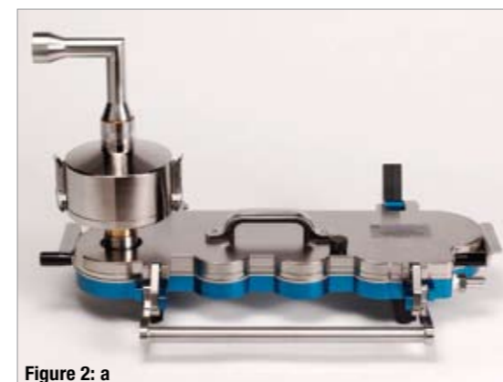
Figure 2: a